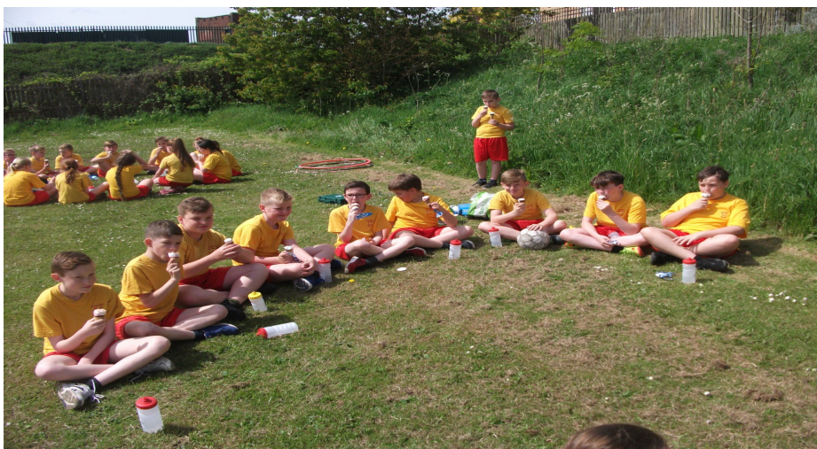
Class 6 children relaxing after the SATs tests.

In the middle of May we had the dreaded SATs tests for the Year 6's. All of the Year 6 children have worked hard and tried their very best, which is all we can ask of them and we are very pleased with our results which are well above national averages.