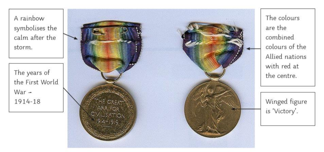
Bronze medal, not too expensive after the war, but long lasting.

This medal celebrated the end of the First World War and was given to soldiers who had fought in active theatres of the war. It was a symbol of great pride but its design was also highly symbolic .