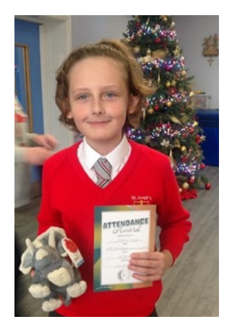
Our Attendance Champions Autumn 2022!